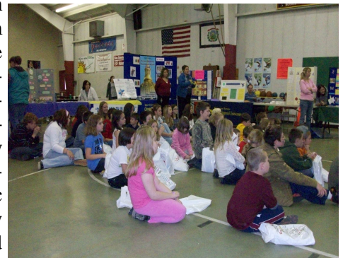
Kids gather to watch a fashion show put on by their peers.

WVU Extension Service (Germ City), WV Crime Victims Compensation Fund, Amber Alert, Webster County Health Department, Catholic Community Charities, and Solid Waste Authority. An interesting twist was the fashion show of items from Twice as Nice, a local thrift store, held during lunchtime. The middle school student models got to choose and then take home the items they modeled. Family Resource Network provided lunch for the exhibitors at both events. HSTA stu-